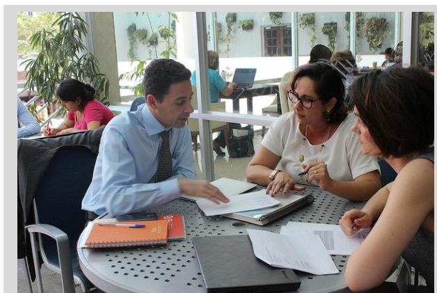
Participants from Brazil discuss options for generating and budgeting domestic public funds for adaptation.

While fiscal instruments have often been used to address mitigation considerations, their potential to finance adaptation has received less attention. Following an introduction to fiscal instruments, participants worked in their country teams to discuss the potential to use some of these instruments to support adaptation in their own country. Figure 4 summarizes some examples of fiscal instruments presented, and their potential for financing adaptation.