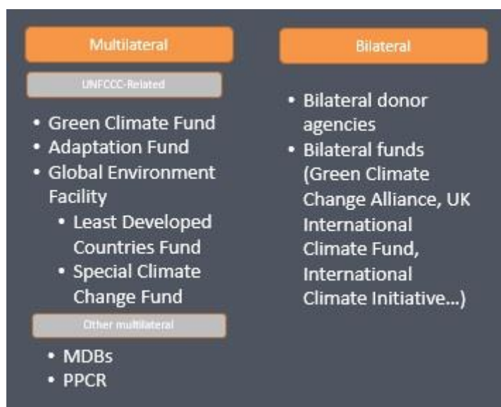
Figure 5: Examples of sources of international public finance for adaptation

Participants also discussed the opportunities and challenges associated with multilateral support for adaptation in a changing landscape, particularly in light of relatively new funds like the Green Climate Fund (GCF). Even before addressing implementation through these funds, the NAP process itself is seen as an important step in demonstrating readiness to access and use them—enhancing country ownership and access to the funds. Participants discussed options of direct versus indirect access to the GCF and reflected on experiences with these modalities through the Adaptation Fund. Sharon Lindo of the Caribbean Community Climate Change Centre (5Cs) shared opportunities and challenges related to working with different sources of international climate change finance . As a regional accredited implementing entity for the Caribbean, the 5Cs will act as a regional intermediary offering expertise and support for implementation of GCF projects in the region. A representative of the Planning Institute of Jamaica (PIOJ) reflected on experience as a nationally accredited entity under the Adaptation Fund, and the extent to which this enhances country ownership.