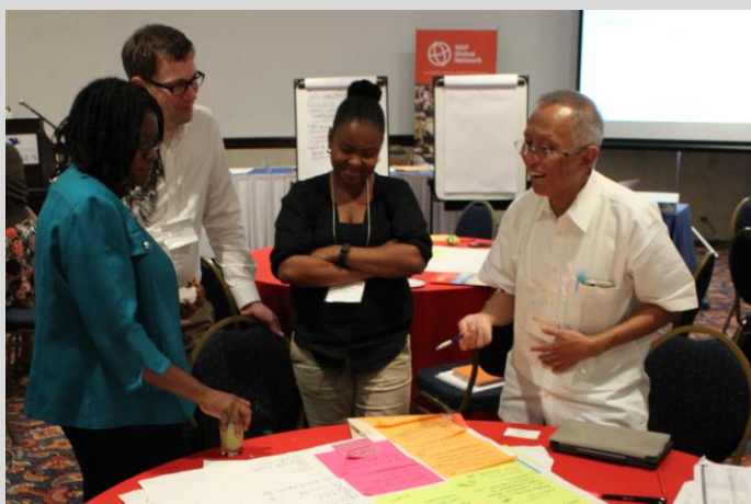
Participants from Philippines, Jamaica, and Germany discuss their plans moving forward.

Participants worked with their country teams throughout the event to identify how they plan to take forward learning after the TTF. Action plans included a wide range of actions such as further exploration of how fiscal instruments might be used to finance implementation of a NAP, exploring the possibility of setting up a system to track finance for adaptation, pursuing capacity building or developing guidance for various sectors involved in the NAP process to access different sources of climate finance and/or for adaptation project development and management. There was also significant interest in following up with their peers from other countries to learn more from their