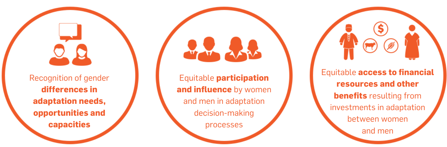
Figure 1 (next page) provides an overview of what it looks like when these considerations are effectively integrated in the NAP process.

Applying this to the NAP process requires attention to gender throughout the iterative cycle of planning, implementation and monitoring and evaluation. It also means consideration of gender issues in the crosscutting dimensions, including institutional arrangements, capacity development and information sharing. A gender-responsive NAP process involves: