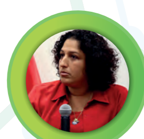
Fabiola Muñoz Dodero Minister of Environment