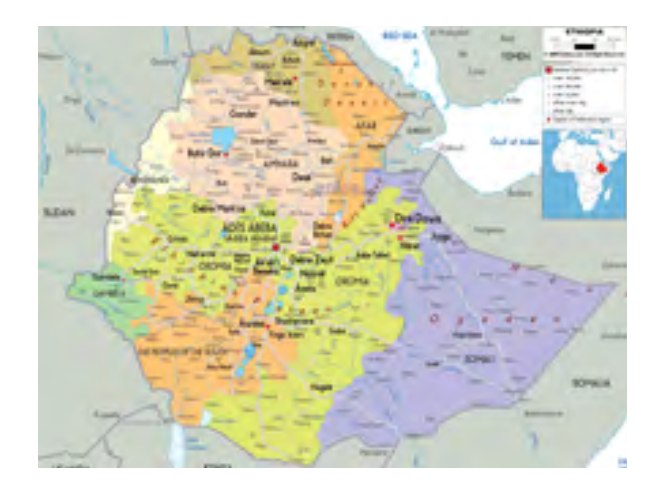
Figure 1. Ethiopian political map

According to Echeverria and Terton (2016, pg. iii) changes to Ethiopia's climate (including changes to rainfall variability, increased